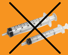
Syringes (without needles)