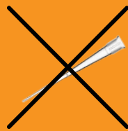
10 µl pipette tips