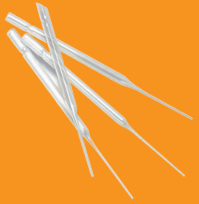
Glass pasteur pipettes