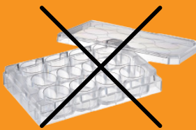
6 & 12 well plates