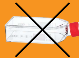
Cell culture flasks