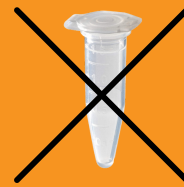
1.5 mL tubes