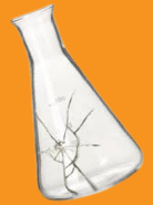
Broken glass (flasks, bottles)