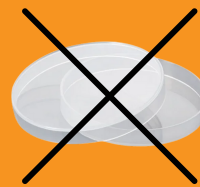
Plastic petri dishes