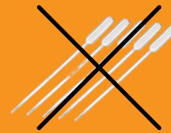
Plastic pasteur pipettes