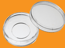
Glass bottom dish