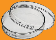
Glass petri dish